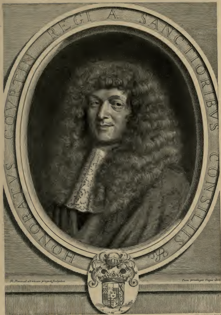
Honoré Courtin Ambassador to England, 1665 by Lantouil